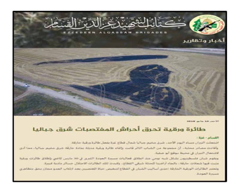
Izz ad-Din al-Qassam Brigades, HAMAS military wing, Since the start of the Great Return March on March 30, Palestinian youths have been firing incendiary kites with incendiary torches on almost a daily basis towards our occupied territories east of the Gaza Strip, which caused heavy losses to the occupation." May 5, 2018