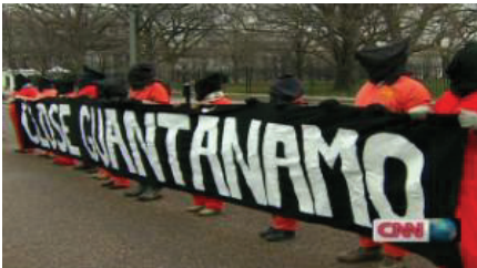
Guantanamo Bay's past and future

This nightmare continues today. Despite promises to close Guantánamo and reverse the illegal policies of the Bush administration, President Obama has attempted to legitimize them. He has signed an executive order formalizing indefinite detentions at Guantánamo, resumed illegitimate military commissions, and refused to hold U.S. officials accountable for torture.