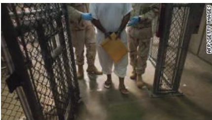
A look at Guantanamo Bay prison

This nightmare continues today. Despite promises to close Guantánamo and reverse the illegal policies of the Bush administration, President Obama has attempted to legitimize them. He has signed an executive order formalizing indefinite detentions at Guantánamo, resumed illegitimate military commissions, and refused to hold U.S. officials accountable for torture.