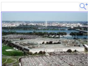
This undated photo, released by the US Department of Defense, shows an aerial view of The Pentagon