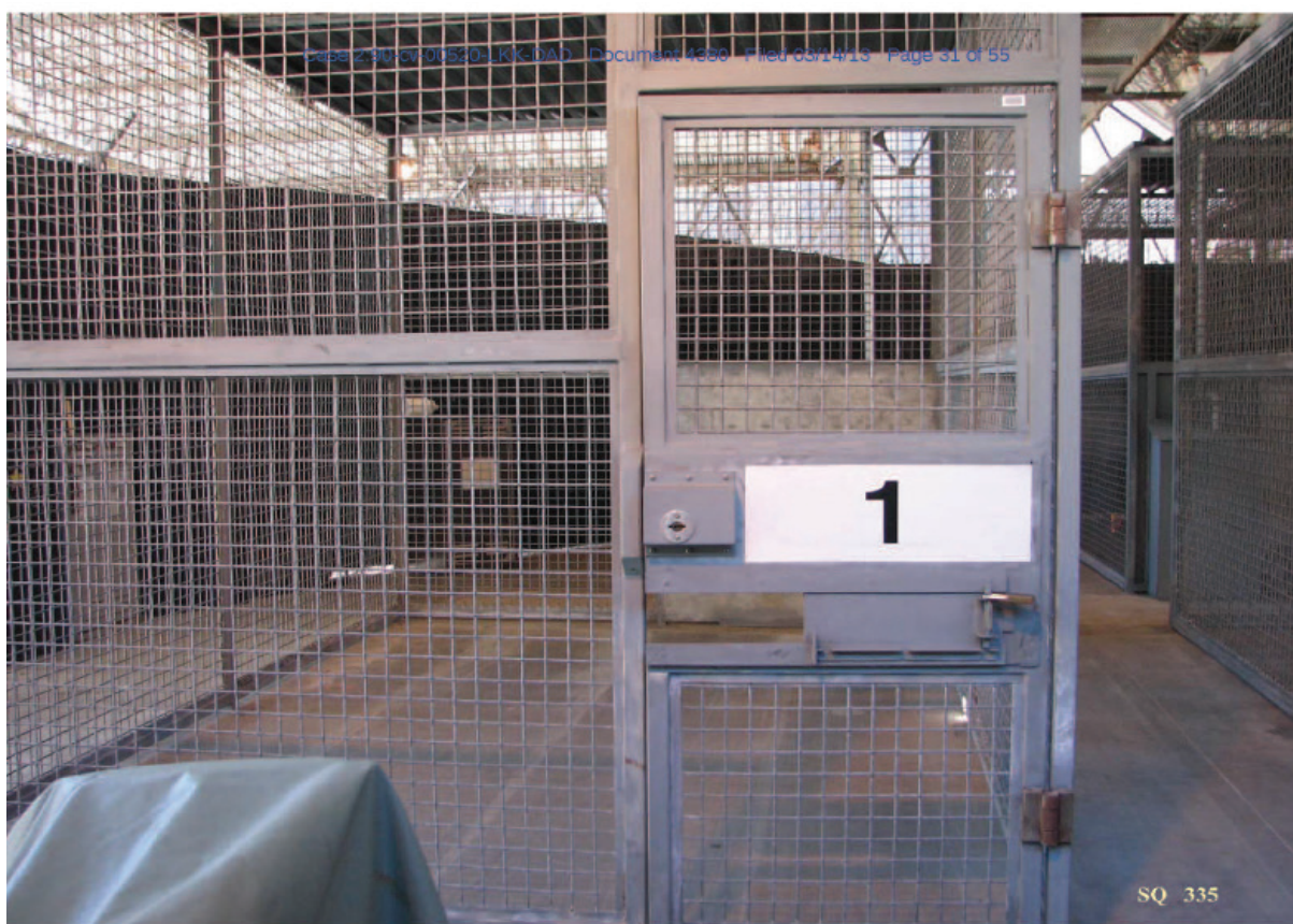
Walkalone yard in East Block at San Quentin's death row.

and screaming down the halls [and noises from] radios and TVs; it's enough to drive you nuts." 189 With over 250 cells along each wall stacked five stories high and separated only by tiered walkways, noise from the walkways and from each of the cells can be heard by all. While the minority of inmates who reside in North Seg may leave their cells and access a small communal indoor space for a portion of each day, those in East Block and the Adjustment Center – or about 90 percent of the death row population – have no communal space besides the recreation yard. The Adjustment Center is the solitary confinement unit within death row and provides the most restrictive housing conditions; prisoners in the Adjustment Center are locked in their cells for all but nine hours a week.