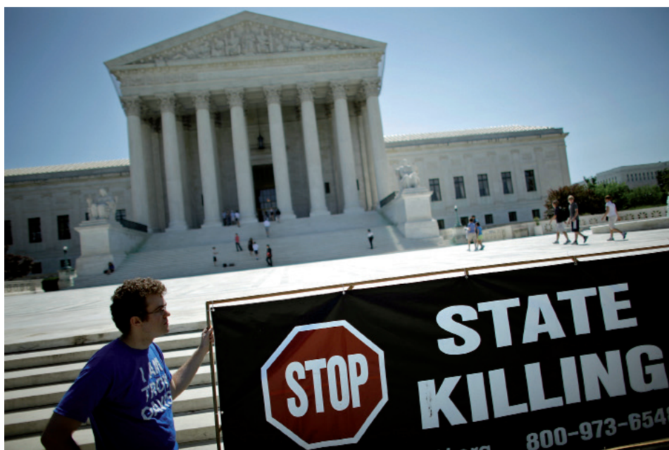
US Washington – June 29 2009, Abolitionist Action Committee protests in front of the US Supreme Court

Inter-American Commission has found that the maintenance of inhuman conditions, coupled with inadequate medical care and not reacting properly to suicide threats constituted a “series of omissions that caused [the victim’s] health to deteriorate and ultimately caused his death.” 432 Although the mission has not evaluated the 22 specific incidences of suicide in California’s death row, the testimony it received leads it to conclude that the poor conditions, lack of health care, and lack of monitoring are similar to those which have been found to contribute to an inmate’s suicide risk. Although, the Inter-American Commission has found that in addition to the multitude of stressors already inherent in detention “the incarceration of an individual in isolation conditions that do not meet the applicable international standards constitutes a risk factor for suicide.” 433