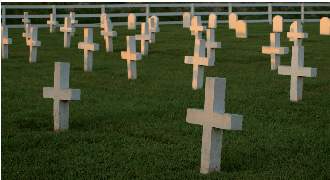
Cemetery at Angola Prison