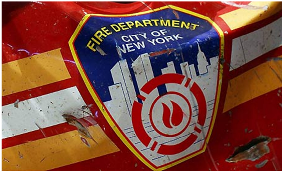
A door from a firetruck crushed by the collapse of the World Trade Centre displayed at the Smithsonian Museum in Washington, DC.

Martin Kettle : 'US politics remains defined by an argument over tax cuts and government, which long predates 9/11'